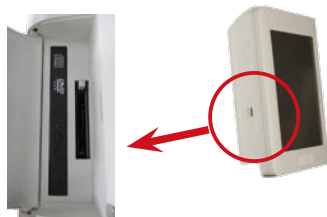
Optical Drive and Express Card Slot

The POC-3174A has an optical drive at the side of the panel, allowing real-time image burning purpose. The built-in optical drive makes POC-3174A a perfect image processing terminal.