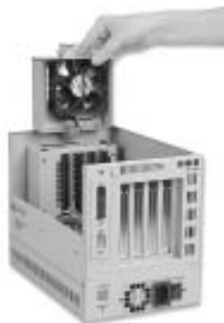
Hot-swap cooling fan