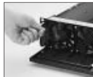
Removable fan filter on the front panel