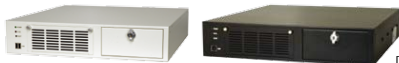
RACK-220GW / 221GW