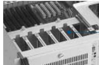
Internal 5 x 3.5" drives