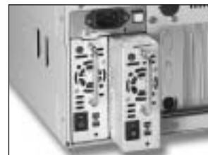
Optional hot-swap redundant power supply