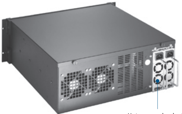
Hot swap redundant power supply