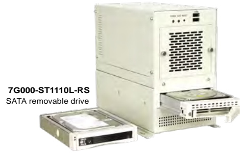
3.5" SATA removable drive bay compatible