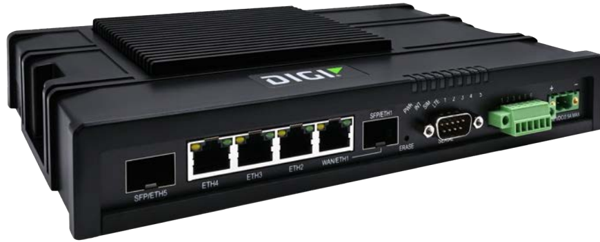
DIGI IX40 — FRONT