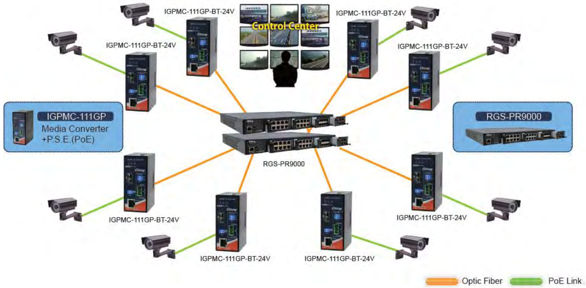
Connections of Media converter

The IGPMC-111GP-BT-24V with wide operating temperature range from -40 ~ 75°C and accepts a wide voltage range from dual 12~57 VDC power inputs, so it is suitable for harsh operating environments. Therefore, the IGPMC-111GP-BT-24V is reliable media converter with PoE capability and can satisfy most demand of operating environment.