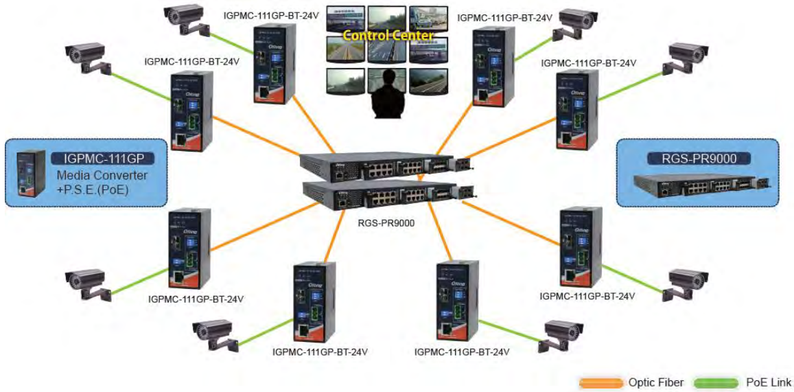
Connections of Media converter

The IGPMC-111GP-BT-24V with wide operating temperature range from -40 ~ 75°C and accepts a wide voltage range from dual 12~57 VDC power inputs, so it is suitable for harsh operating environments. Therefore, the IGPMC-111GP-BT-24V is reliable media converter with PoE capability and can satisfy most demand of operating environment.