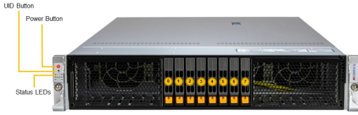
(Front View – System)