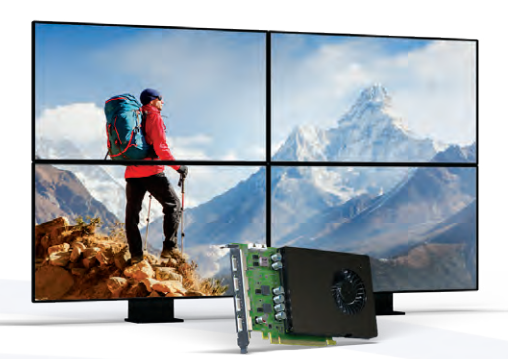
D-Series D1450 - Quad HDMI graphics card

Full-height, Gen 3 PCIe® x16 four-output graphics cards with four native HDMI® or DisplayPort™ connectors deliver the best display density, resolution, and performance for demanding multi-monitor applications.