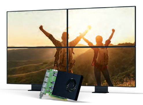
D-Series D1480 - Quad DisplayPort graphics card