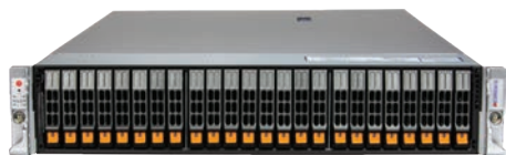
2U A+ Server 2125HS-TNR (NVMe/SAS/SATA)