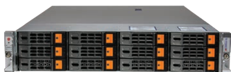
2U A+ Server 2025HS-TNR (NVMe/SAS/SATA)