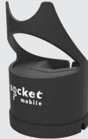
Universal Charging Dock SKU# AC4133-1871