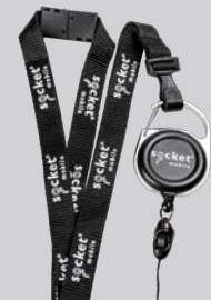
Lanyard - Black AC4100-1692