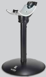
Charging Stand SKU# AC4076-1538