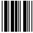
1D Imager Barcode Scanner