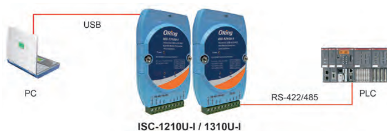
Connections of USB to Serial Media Converter

The ISC-1210U-I / ISC-1310U-I converter is an intelligent, stackable expansion module that connects to a PC USB port or USB Hub via the Universal Serial Bus(USB) port, providing one High-Speed RS-232/RS-422 or RS-485 serial port(jumper-less). The ISC-1210U-I / ISC-1310U-I features easy connectivity for traditional serial devices. The RS-232 standard supports full-duplex communication and handshaking signals (such as RTS, CTS) and the RS-485 control is completely transparent to the user and software written for half-duplex operation without any modification. The ISC-1210U-I / ISC-1310U-I's opto-isolators provide 3000 VDC of isolation to protect the host computer from destructive voltage spikes on the RS-232/RS-422 and RS-485 data lines. ISC-1210U-I / ISC-1310U-I also offer internal surge-protection on data lines. The internal high-speed transient suppressors on each data line protect the modules from dangerous voltages levels or spikes. In addition, the ISC-1210U-I / ISC-1310U-I module derives the power from USB port and doesn't need any aid of external power adapter.