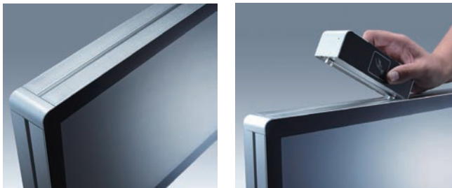
Side groove design for Flexible peripheral device